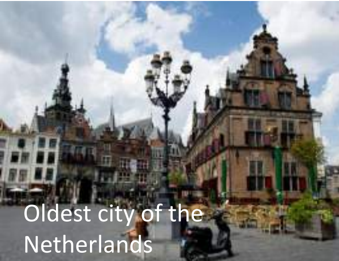
Oldest city of the Netherlands