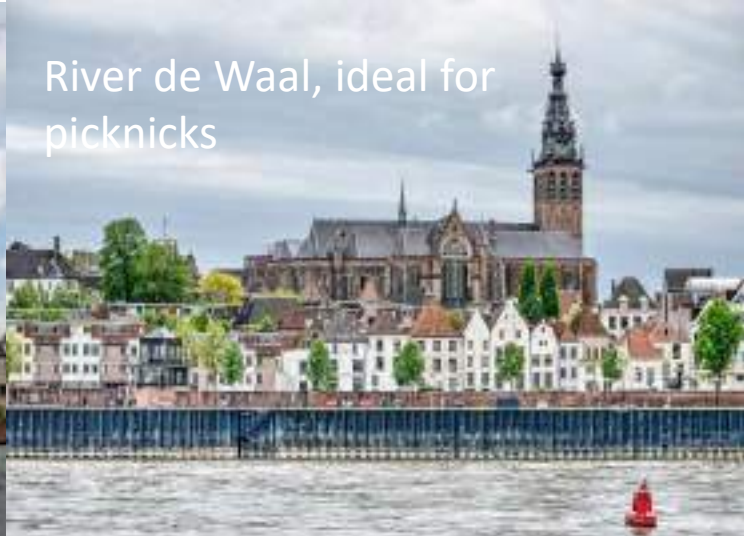
River de Waal, ideal for picnics